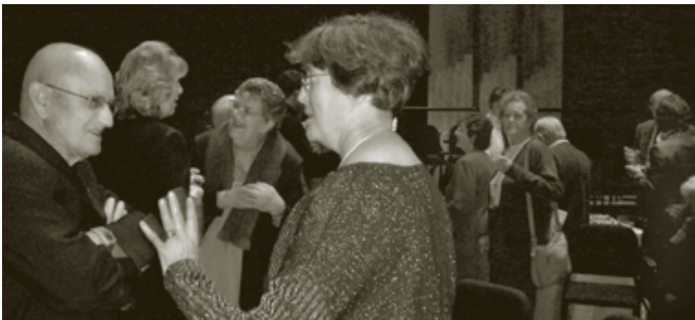
Welcoming back alums on the Hertz Hall stage last April.