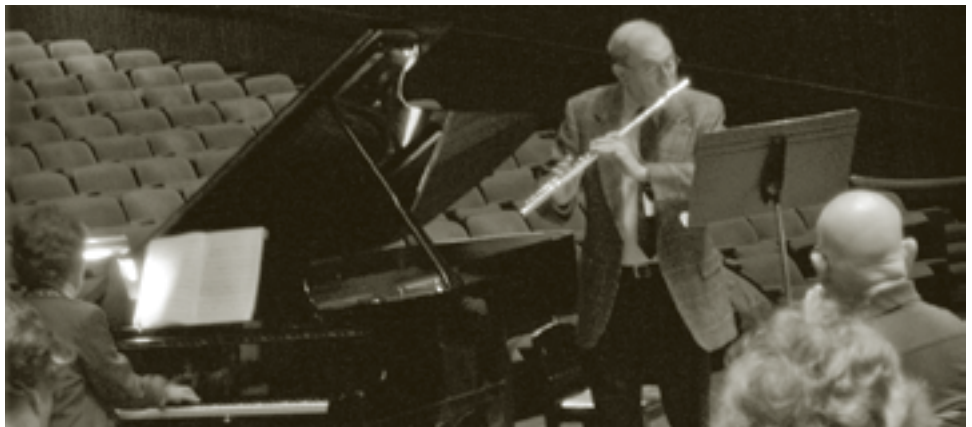
Alums perform with the new concert piano in Hertz Hall.