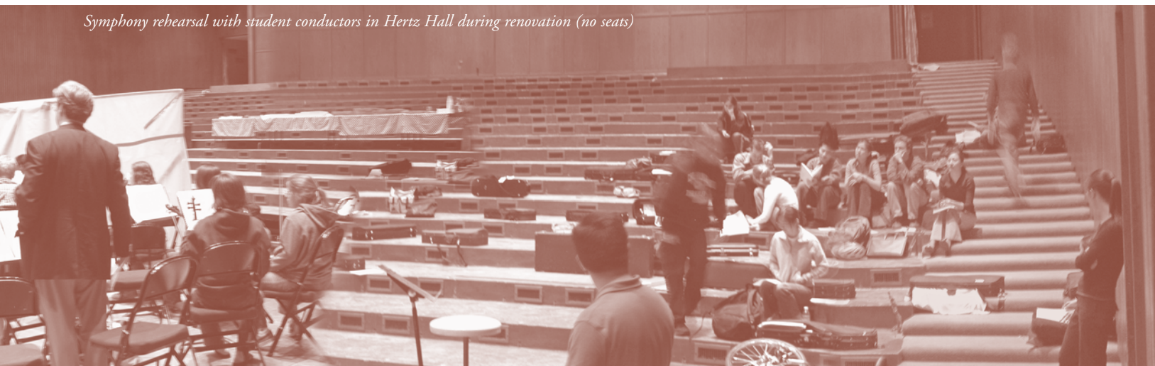
Symphony rehearsal with student conductors in Hertz Hall during renovation (no seats)