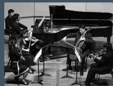
Students perform Bloch's Piano Quintet #2