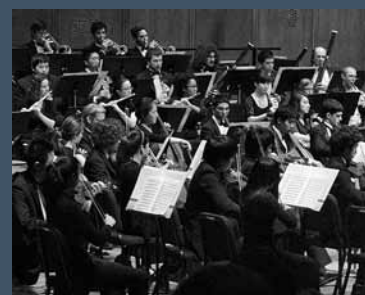
University Symphony Orchestra