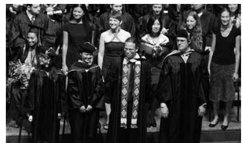
Graduates at commencement ceremony, 2010