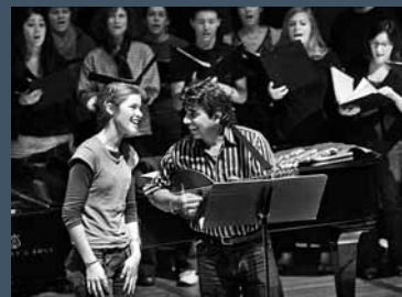
University Chorus, “Gypsy Traditions”