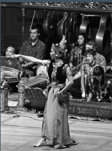
Gamelan Sari Raras with guest dancers

BERKELEY CARILLON, continued from page 11