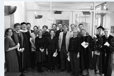
Music faculty at commencement 2010