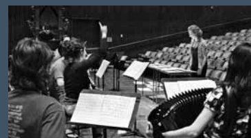
Jazz & Improvised Music Ensemble