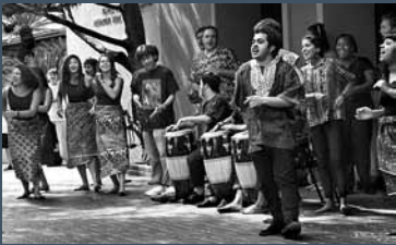
African Drumming & Dance on Cal Day