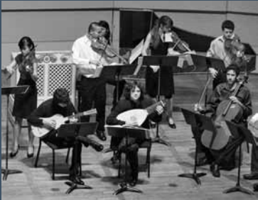
University Baroque Ensemble